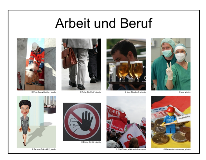
Figure 1: Subject area work and profession

Each subject area is presented as a written German phrase with 4 to 8 photographs or drawings to complement the written input and to stimulate the informants' associations (figure 1).